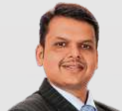
Devendra Fadnavis Hon'ble Deputy Chief Minister Govt. of Maharashtra

Saturday, December 3, 2022 | 10 AM to 6 PM