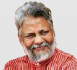
Dr. Rajendra Singh Water Man of India Magsaysay Award (2001) Stockholm Water Prize (2015)