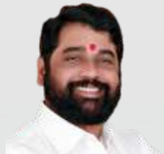
Eknath Shinde Hon'ble Chief Minister Govt. of Maharashtra